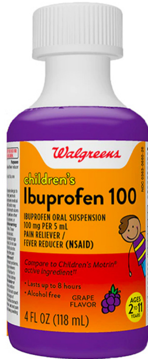
ibuprofen (Advil®, Motrin®)